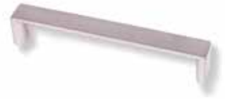
Flat HANDLE BRUSH NICKEL H0240