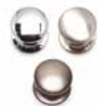
Windsor Round Knob 40 BRUSH NICKEL H2245 40 CHROME H2205 PEWTER H3010