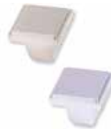
Westminster KNOB BRUSH NICKEL H2290 KNOB CHROME H2280