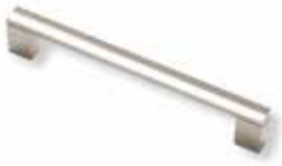
Aries HANDLE 204 BRUSH NICKEL H0510