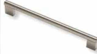
Damask HANDLE 214 BRUSHED NICKEL H0680