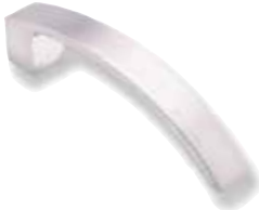
Buick HANDLE BRUSHED NICKEL H0040