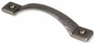
Mottled D HANDLE PEWTER H1560