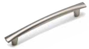
Bow T BAR SMALL 160 BRUSH NICKEL H3380