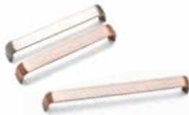
Camden D HANDLE 128 BRUSH NICKEL H3190 HANDLE 128 ANTIQUE COPPER H3210 HANDLE 192 ANTIQUE COPPER H3220